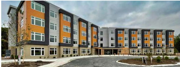
Gordon H. Mansfield Veterans Village Tinton Falls

Our response to that profound sense of privilege is a commitment to client service and design excellence through timely submittals and value conscious designs combined with the principals of Sustainable Design and Smart Growth.