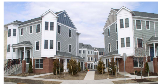
The Michaels Organization - Barbara Place Terrace

Project Freedom Inc.. National Resources WinnDevelopment Ingerman Related Affordable K. Hovnanian Community Investment Strategies The Michaels Organization Allegro Senior Living Kitchen & Associates Ridge Oak Related Companies SoldierOn