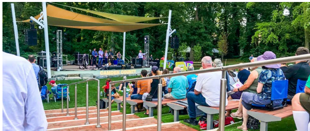
Haddon Heights Dell