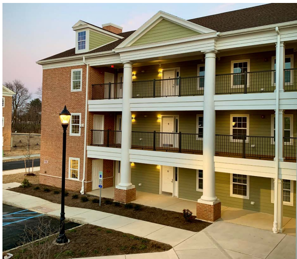
Project Freedom Gibbsboro

Senior Housing Veteran Housing Affordable Housing Special Needs Housing Mixed-Income Housing Continuing Care Retirement Communities