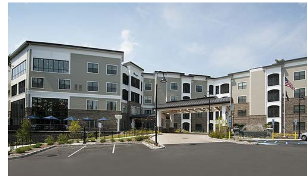
Allegro Senior Living Facility