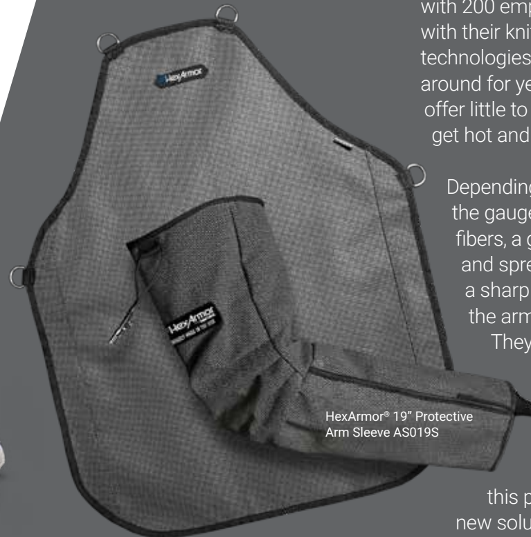
HexArmor ® Protective Apron AP321