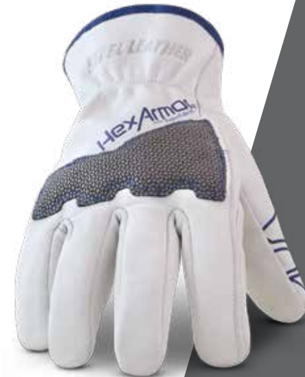
HexArmor ® SteelLeather ® 5033

160+ Lacerations Per Year Average REDUCED TO ZERO