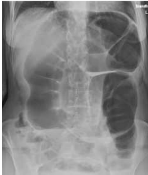
Case 4. A 15-year-old boy with primary sclerosing cholangitis and pouchitis and enteritis ( Joseph Picoraro, MD, Columbia University )