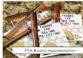
PTA Board Appreciation