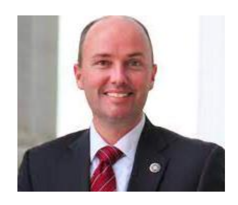
Governor Spencer Cox