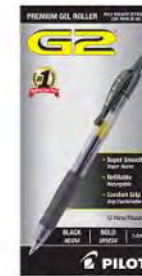
PILOT G2 Premium Refillable & Retractable Rolling Ball Gel Pens, Bold Point, Black Ink, 12 Count (31256)