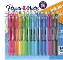
Paper Mate Gel Pens | InkJoy Pens, Medium Point, Assorted, 14 Count