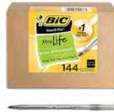
BIC Round Stic Xtra Life Ballpoint Pen, Medium Point 144 ct