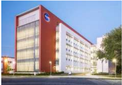
NASA Langley Measurements Systems Lab Hampton, Virginia