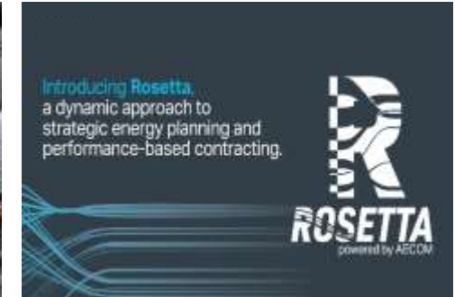
AECOM's Rosetta Platform Multiple Applications