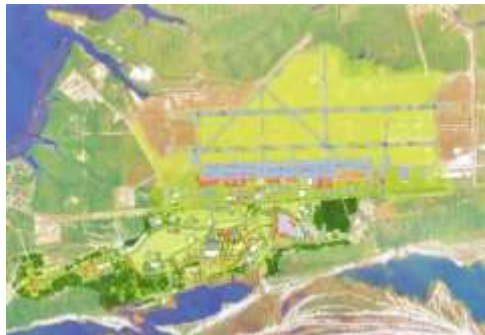
Tyndall Air Force Base Recovery Program Tyndall AFB, Florida