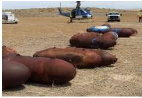
Utah Test & Training Range MMRP Surface Clearance Hill AFB, Utah