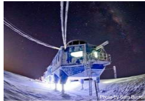
Halley VI Research Station Brunt Ice Shelf, Antarctica