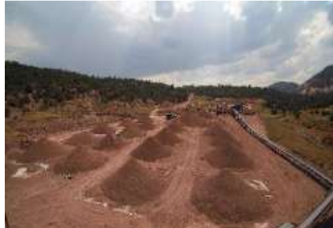
Military Munitions Response Program (MMRP) Removal Action Fort Wingate, New Mexico