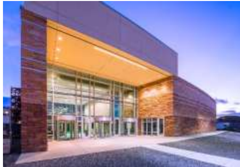
U.S. Army Pacific Command & Control Facility Fort Shafter, Hawaii