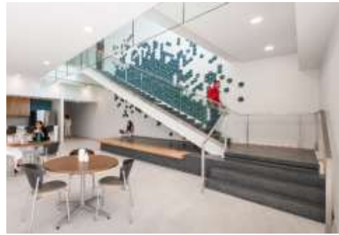
U.S. Army Medical Research Acquisition Activity Facility Maryland