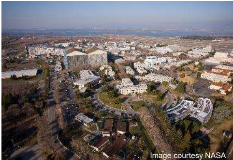
NASA Strategic Energy Investment Program Nationwide, U.S.