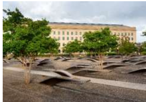
Pentagon Renovation Arlington, Virginia