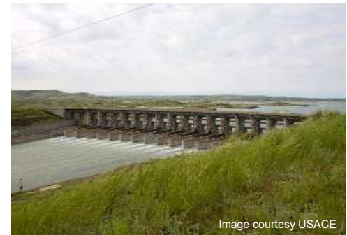
Dam Plunge Pool Repairs Fort Peck, Montana