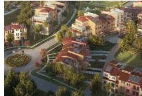
Vicenza Army Family Housing Site Development Plan Italy