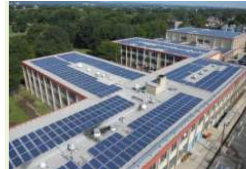
Solar 4 All® Multiple Cities, New Jersey