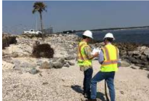
Shoreline Erosion Repair Investigation NS Mayport, Florida