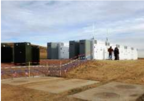
Battery Energy Storage System Fort Carson, Colorado