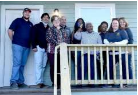
Hurricane Harvey Housing Implementation Services West Regions, Texas