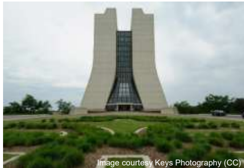
Fermi National Accelerator Lab Batavia, Illinois