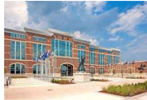
U.S. Army Maneuver Center of Excellence Renovation Fort Benning, Georgia