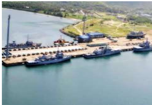
Seabird Project Karwar, India