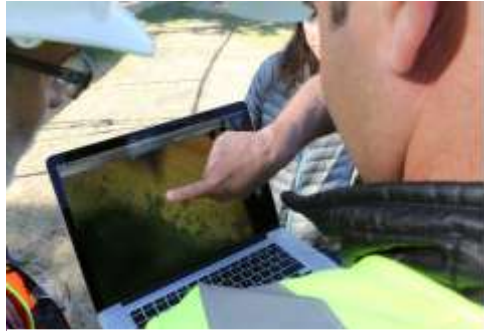
Digital NEPA Multiple Applications