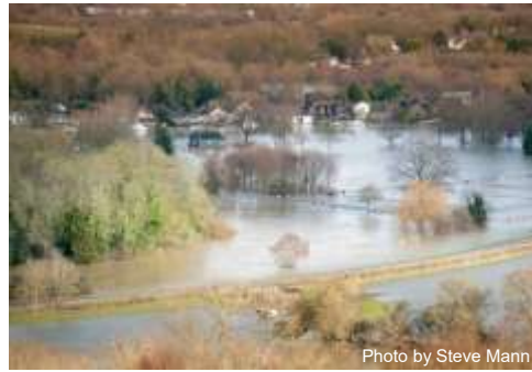
Water & Environment Management (WEM) Framework United Kingdom