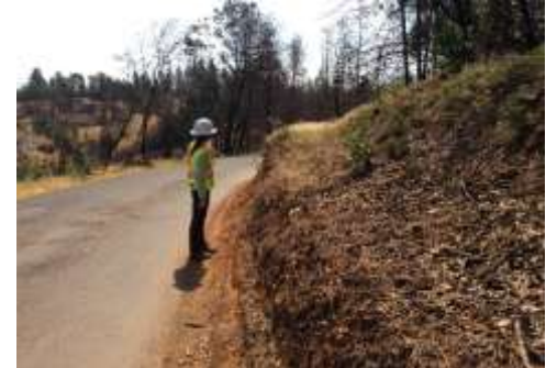
California Wildfires Compliance Services Cook County, California