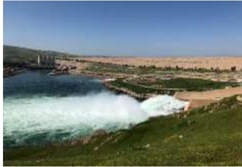
Mosul Dam Rehabilitation Mosul, Iraq