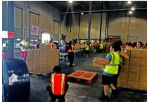
Hurricanes Harvey, Irma & Maria Response & Recovery Multiple States & Territories, U.S.