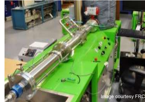
Fleet Readiness Center Southwest ESPC Coronado, California