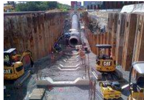
Rio Puerto Nuevo Flood Control San Juan, Puerto Rico