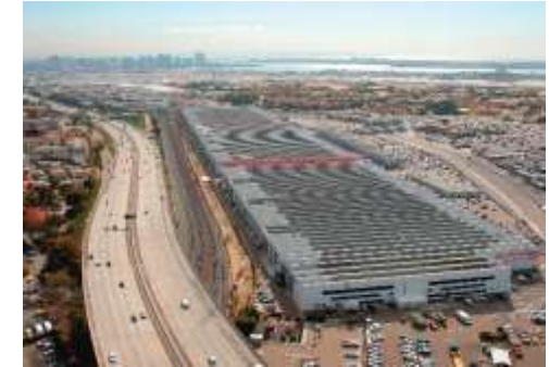
SPAWAR Systems Center Pacific ESPC San Diego, California