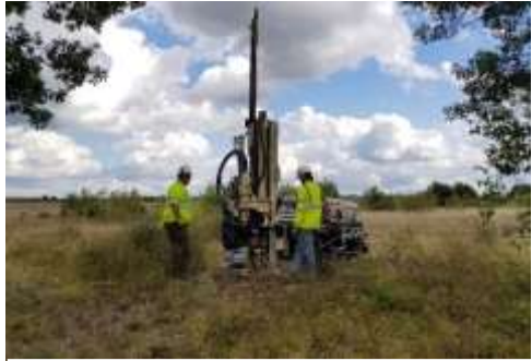
U.S. Army NG Preliminary PFAS Site Inspections Multiple Applications