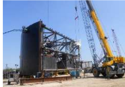
Inner Harbor Navigation Canal Protection New Orleans, Louisiana