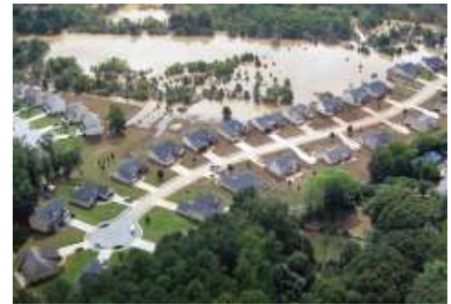
Hurricane Florence STEP Program North Carolina