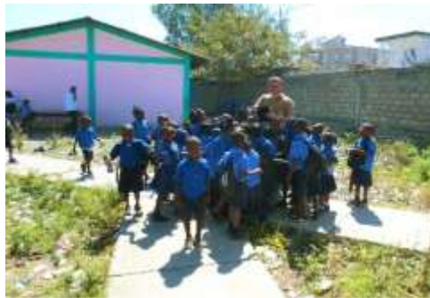
Haiti Earthquake Reconstruction Port-au-Prince, Haiti