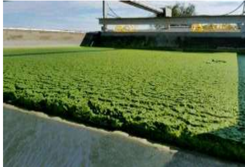
P3 Toxic Algae Remediation Lake Okeechobee, Florida