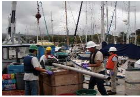
Contaminated Sediment Remediation Pearl Harbor, Hawaii