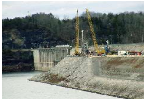
Wolf Creek Dam Instrumentation Russell County, Kentucky