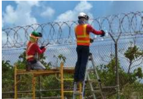
Typhoon Mawar Repair & Recovery Guam