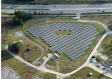
Sustainable Energy/ Photovoltaic Design-Build Construction MCB Camp Lejeune, North Carolina