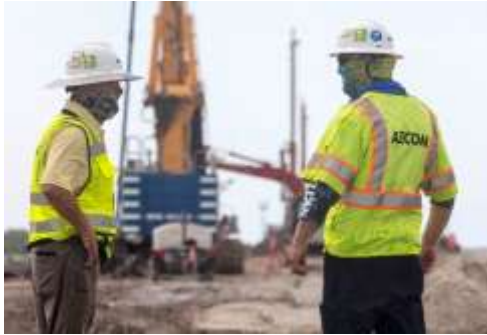
Herbert Hoover Dike Lake Okeechobee, Florida