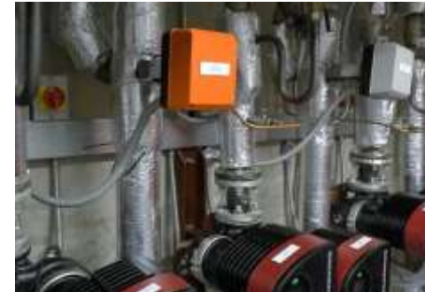
GIS Heat Mapping for Scottish Government United Kingdom