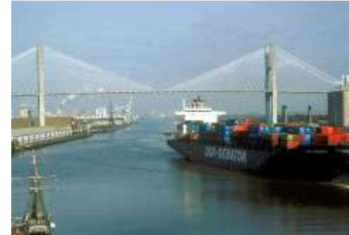
Savannah Harbor Navigation Project Savannah, Georgia