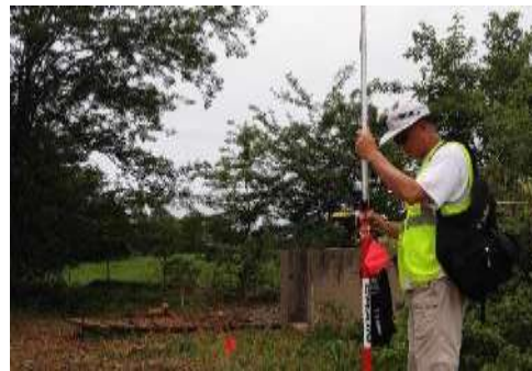
Sunflower Army Ammunition Plant Soils Investigation De Soto, Kansas