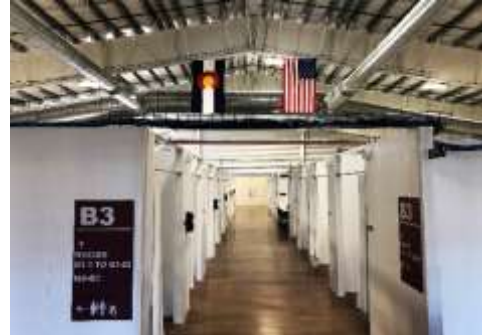
Alternate Care Facilities, COVID-19 Pandemic Response Multiple Locations, U.S.