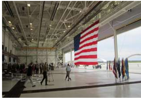
F-35 Hangar & Aircraft Apron MCAS Beaufort, South Carolina