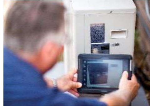
U.S. Air Force Sustainable Infrastructure Assessments Multiple Locations, U.S. & Europe