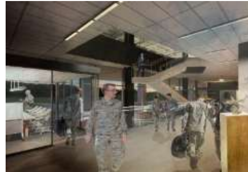
U.S. Air Force Madera Cyber Innovation Center Colorado Springs, Colorado