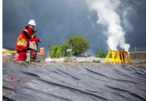
Lac Megantic Train Derailment Response & Recovery Quebec, Canada