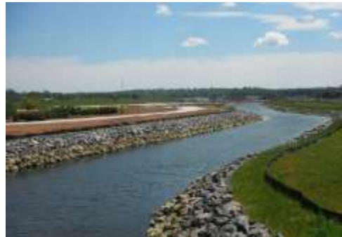
Sydney Tar Ponds Nova Scotia, Canada