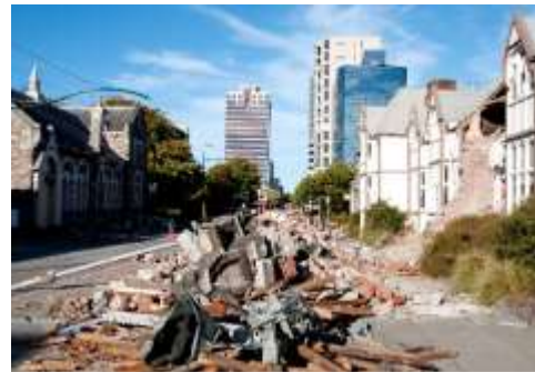
Christchurch Earthquake Recovery Christchurch, New Zealand