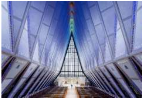
U.S. Air Force Academy Cadet Chapel Design Services Colorado Springs, Colorado