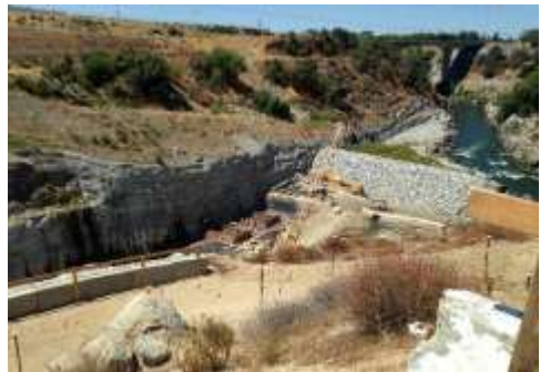
Folsom Dam Auxiliary Spillway Folsom, California