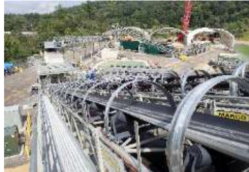
Chickamauga Lock Replacement Chattanooga, Tennessee